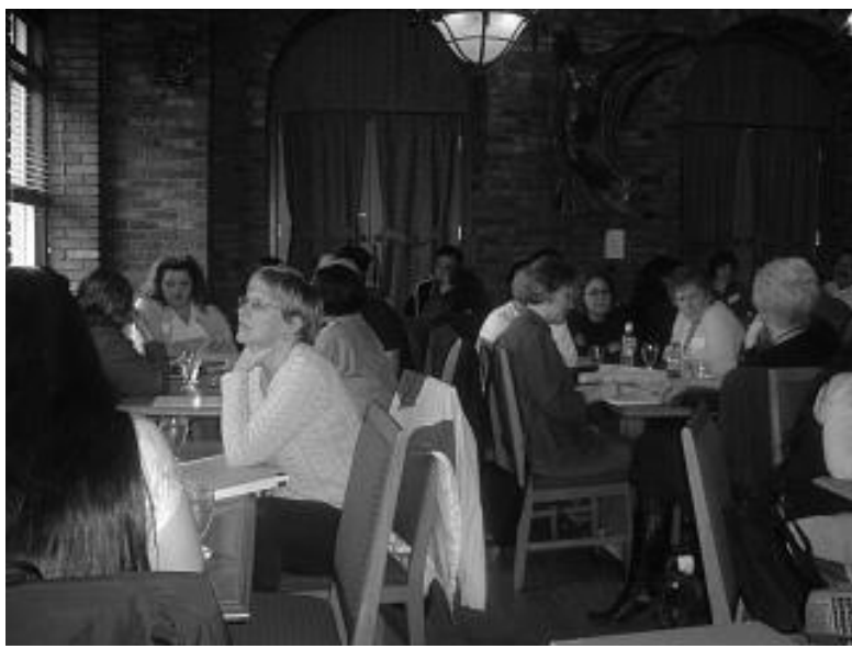
Victoria, BC CAB Session April 25-26, 2007