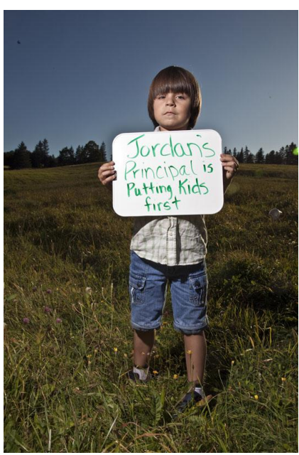
Child from Tobique First Nation

Ontario fully supports Jordan's Principle and pledges to work with First Nations and the federal government to ensure Jordan's Principle is honoured and applied in the province of Ontario. Honourable Brad Duguid, Ontario Minister of Aboriginal Affairs, April 22, 2009