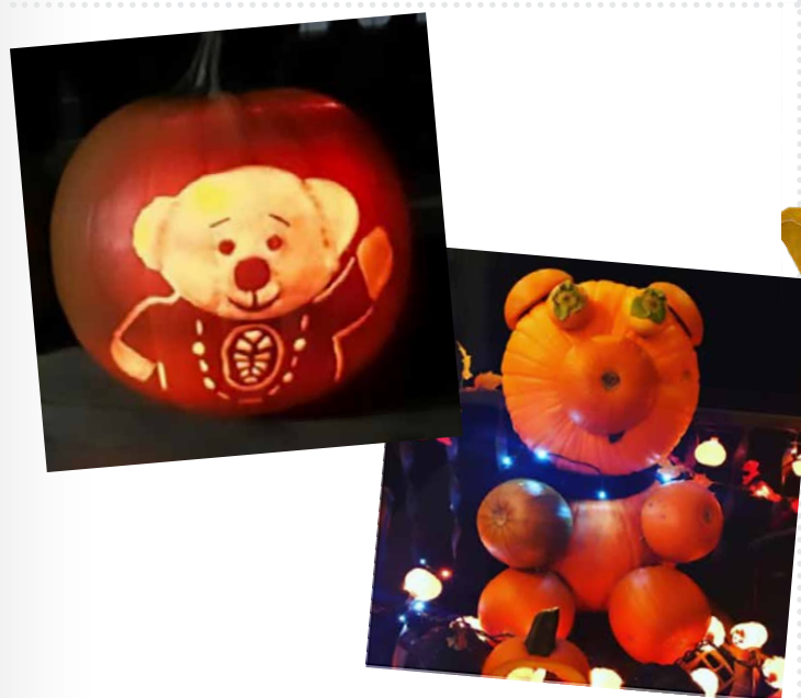
Spirit Bear's Pumpkin Carving Contest Winners from 2021!