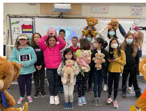
Students of SAM School with their Reconciliation Ambearrister, Asiniwacyi.