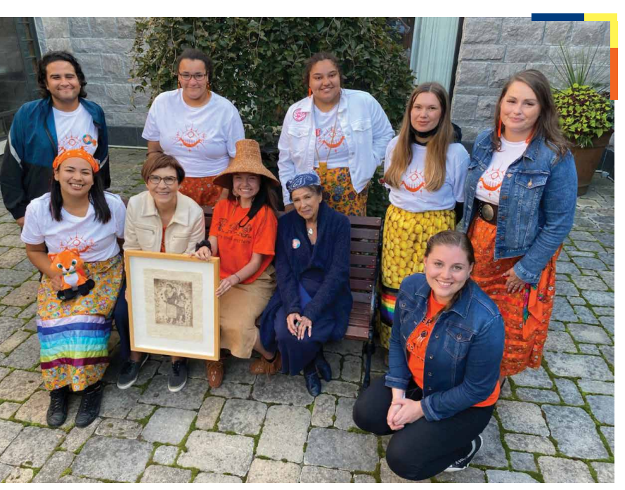
A7G and the Caring Society were honoured to partner with Project of Heart and Beechwood Cemetery to host an event in honour of Orange Shirt Day.

To honour Orange Shirt Day and the first National Day for Truth and Reconciliation, the Caring Society partnered with Assembly of Seven Generations (A7G), Project of Heart and Beechwood Cemetery to host an event on September 30 in Ottawa. The day was an opportunity for people of all ages to learn about Canada's history in the spirit of truth and reconciliation, reflect on the legacy of the residential school system and take action. Keeping with COVID-safe protocols, we hosted 1,500 people at the event throughout the day. Even more people took part virtually across Canada!