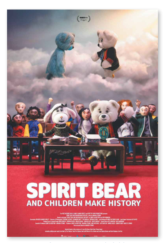
Movie poster for Spirit Bear and Children Make History

Spirit Bear was gifted to the Caring Society by Carrier Sekani Family Services in 2007. Since the very beginning, he has been a witness to the Tribunal case, representing 165,000 First Nations children and their families affected by the case and the thousands of other children who stand with them for fairness and justice.