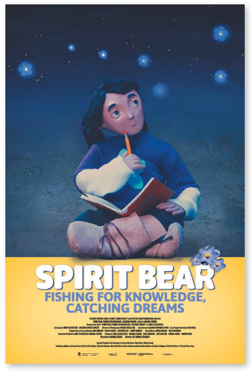
Movie poster for Spirit Bear: Fishing for Knowledge, Catching Dreams

Spirit Bear's first film was released in 2020 and continues to be an important resource for educators and anyone wanting to understand the case for First