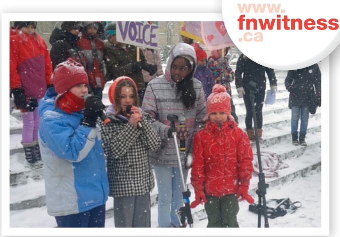
Have a Heart Day on Parliament Hill, February 14, 2014.

The Caring Society supports Have a Heart Day celebrations across Canada with free education and event resources available on the event webpage. The event page also offers a gallery with links to videos and other resources to support video and audio learning preferences. Have a Heart Day would not be possible without the generous support of our partners, such as the labour movement, professional teachers' organizations, Project of Heart, KAIROS and Amnesty International Canada.