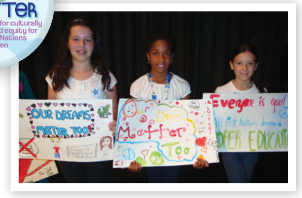
Our Dreams Matter Too Gathering in Ottawa, June 11, 2014...

this year. Your dedication to learning and citizenship matters and truly makes a difference!